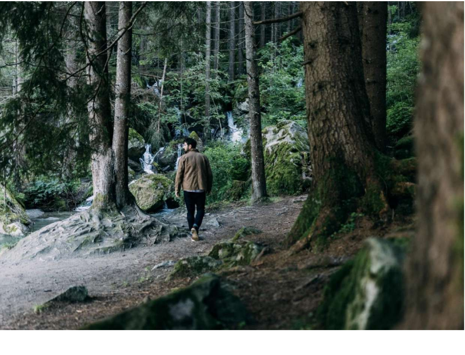
Guided by the gentle breeze of serenity.